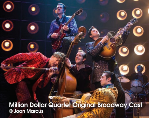
Million Dollar Quartet Original Broadway Cast