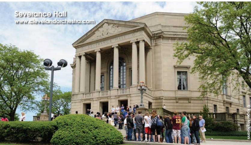
Severance Hall www.clevelandorchestra.com