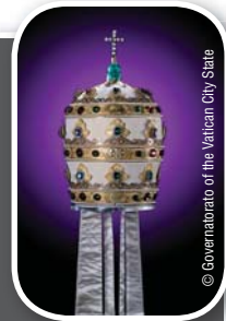
© Governatorato of the Vatican City State

Western Reserve Historical Society May 31 - Sept. 7, 2008 888.5VATICAN www.wrhs.org • www.vaticansplendors.com Don't miss this prestigious collection of 200 Vatican artifacts—one of the largest ever seen in North America. Cleveland is one of only three U.S. stops for these never-before-seen treasures including some of the earliest known depictions of Jesus, a reliquary containing bone fragments of St. Peter and personal belongings of Michelangelo.